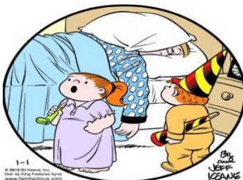
"Daddy said 'Happy New Year,' but I don't think he really meant it!"